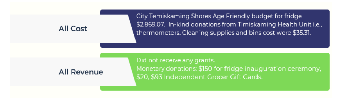
Figure 3: Revenue and Cost of Project

materials/signs from the Timiskaming Health Unit. A routine yearly inspection was conducted by a THU Public Health Inspector. No revenue was generated through the project and the project did not receive grants. The pilot started accepting monetary donations halfway through the pilot. Monetary donations included a donation from Centre d'éducation des adultes in the amount of $150 which was used to purchase the initial food when opening and the refreshments for the ceremony, $20 cash from a community member and $93 in Independent Grocer Gift Cards. The gift cards were used to purchase food for the CF when it was running low on donations.